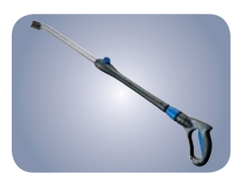
TORNADO 3000 LANCE A robust double-pipe lance with pressure regulation.