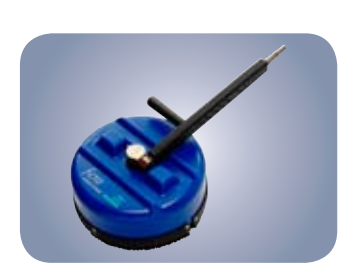
POWERSCRUB P300 Used for flat surfaces, like worktables, stairs, and walls.