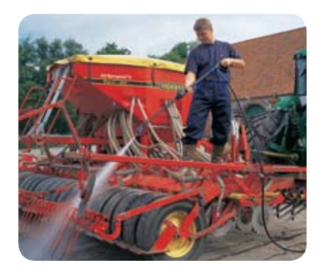
Depend on the POSEIDON 7 SERIES the most reliable cold water pressure washer on the market

Very robust machines, they are built on a metal chassis with high quality components. They are the high pressure washers for professionals who depend on a machine that can work day after day out, week after week, year after year.